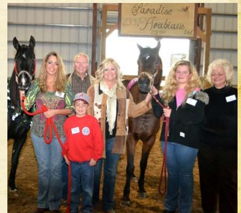
▲ THE WHITES & ▼ THE MASCA-ROS AT THE CLIENT SEMINAR