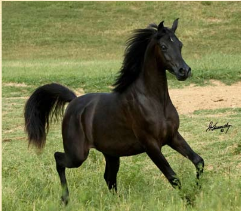
▲ FIND OUT ABOUT PARADISE'S KOHL AL JANNAT

THE BLACK KNIGHT OF PARADISE VERY EXCITING NEWS INSIDE SPECIAL SECTION