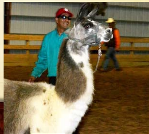
OUR LONG-NECKED NEW “STALLION” ▲