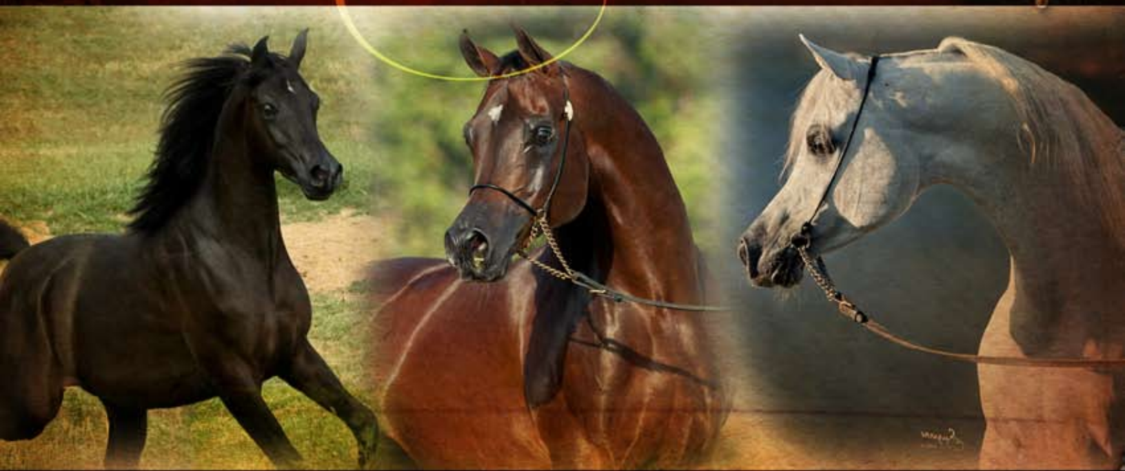
KOHL AL JANNAT